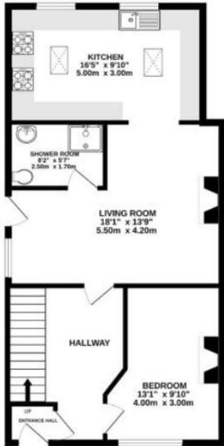
GROUND FLOOR 637 sq.ft. (59.2 sq.m.) approx.